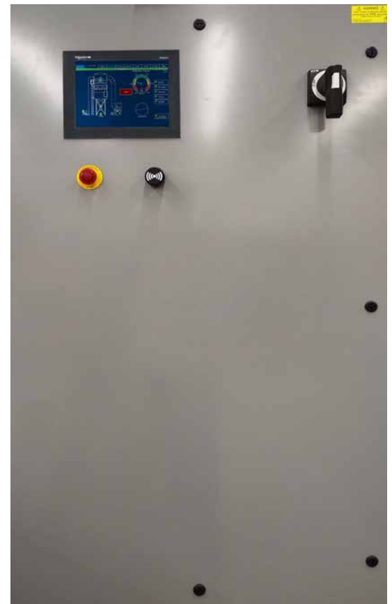
RP Control Panel

To improve system performance, the RP Control Panel can be upgraded to include a variable frequency drive for the fan motor. This upgrade includes an Airflow Controller which adjusts the fan motor speed to keep a constant airflow throughout the life of the filters. The Airflow Controller takes the place of a fan damper to provide automatic airflow control to reduce energy costs.