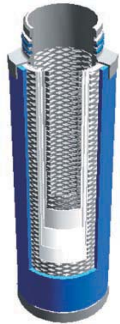
Cross section of the Ultrair depth filter

By utilising various filtration mechanisms such as retention by direct impact, sieve effect and diffusion effect, liquid aerosols and solid particles down to the size of 0.01 µm are being retained in the filter.