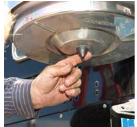
The Donaldson Vacuator Valve can be found on the majority of Donaldson air cleaners.