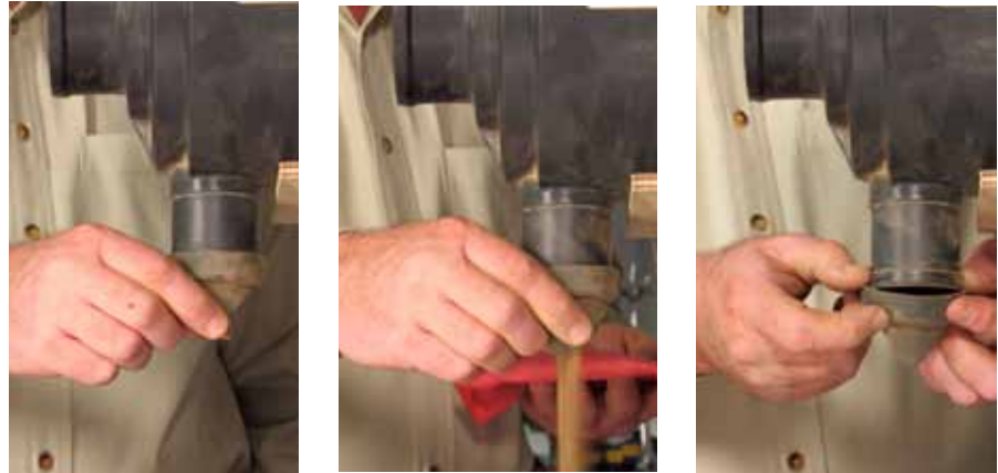
If your air cleaner is equipped with a Donaldson Vacuator™ Valve, make sure your routine filter service includes checking it to make sure it's in good condition and not plugged. If the Vacuator Valve is plugged, clean it out.

The Donaldson Vacuator Valve, also known as VacValve, is made in a variety of sizes and shapes to fit various applications. The Donaldson part number is molded into each part for easy identification.