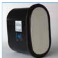
P608533 Donaldson PSD08 PowerCore® Air Cleaner