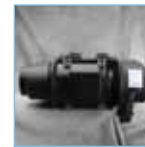
D090055 PSD09 PowerCore® Air Cleaner Assembly Horizontal