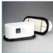
P606122 Ford Donaldson 7.3L PowerCore® Air Cleaner Kit