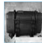
D100031 PSD10 PowerCore® Air Cleaner Assembly Vertical