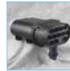
D080020 PSD08 PowerCore® Air Cleaner Assembly Horizontal