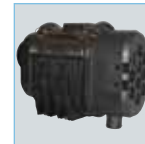
D080056 PSD08 PowerCore® Air Cleaner Assembly Vertical