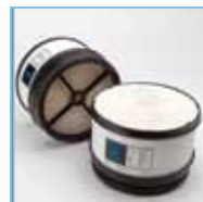
P610875 GM Silverado Sierra 6.6L Duramax Diesel