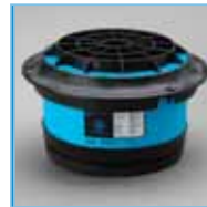
P607955 Freightliner M2 Series