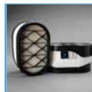
P608666 Donaldson PSD10 PowerCore® Air Cleaner