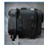
D120035 PSD12 PowerCore® Air Cleaner Assembly Vertical