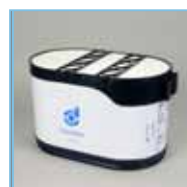
P616056 Kenworth T660 Series