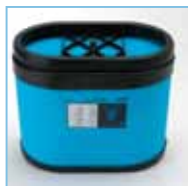
P609086 Ford F-Series F650 F750 6.0L Diesel