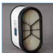
P613522 Ford F-Series 6.4L Diesel