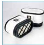
P604273 GM H2 Hummer