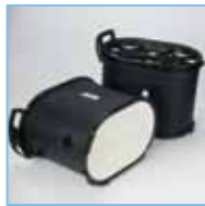
P603577 Ford F-Series Super Duty 6.0L Diesel