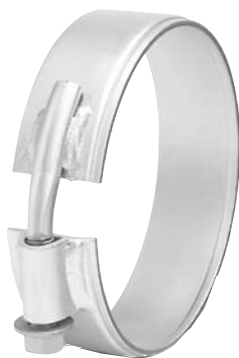
For Muffler to Stack Connections