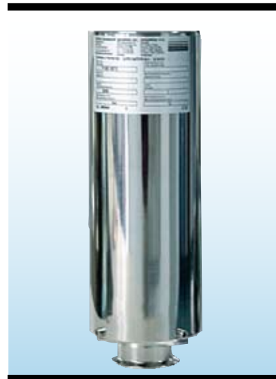
P-BE stainless steel housing for venting storage and holding tanks. Accommodates a variety of filter element types.

The P-BE vent housing is usually used in conjunction with our UltradePTH II™ P-BE vent filter element to assure sterile ventilation with very little pressure drop or air resistance. However, it can be used with many other filter types to meet your specific need.