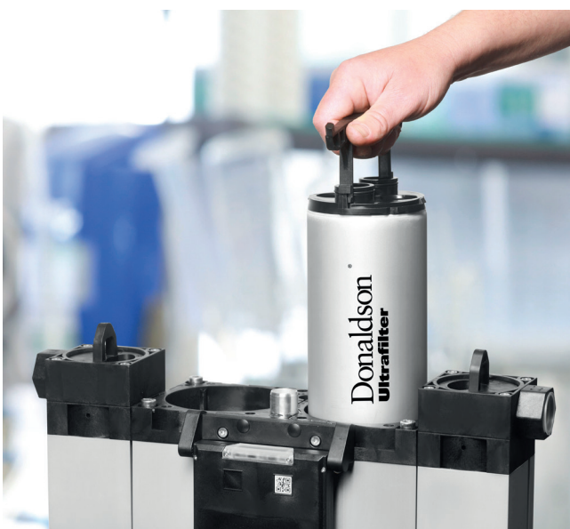
Fig. 3: The desiccant cartridges can be replaced quickly and easily.

period of time. Large deviations have been found. For the Superplus version of the Ultracac™ Smart system, the Ultraconomy dew point control was developed to achieve stable compliance with the specified pressure dew point during continuous operation. This is of particular importance as the dew point temperature changes with changing pressure.