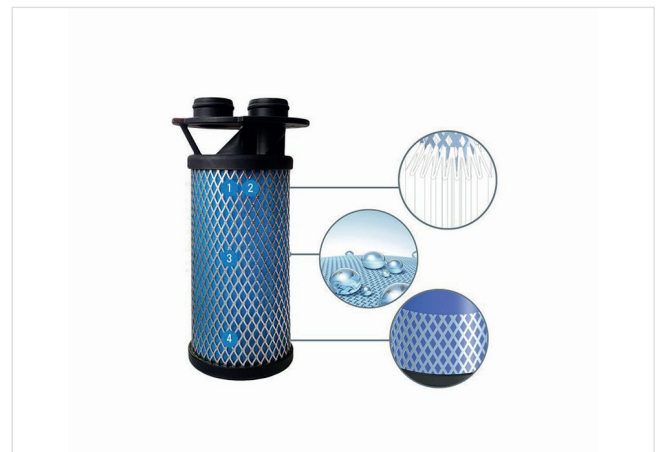
Fig. 4: UltraPleat™ energy-saving filter. 1. New filter media 2. Improved pleat (shape and structure) 3. Improved filter media coating 4. Outer stainless-steel support sleeve

The integrated UltraPleat™ energy-saving filters (Fig. 4) ensure optimum filtration performance at low differential pressure. When the compressed air enters, liquid and solid particles are effectively deposited or retained by the UltraPleat™ pre-filter before it flows into one of the two desiccant cartridges. The afterfilter, which removes solid particles up to 0.01 microns, is the effective securing element so that the dry compressed air is available according to the purity level specifications. The proportion of these