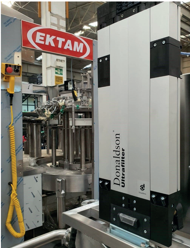
Fig. 1: Provision of compressed air of defined quality at the point of consumption in EKTAM filling lines with Ultrapac™ Smart. The use of the compact compressed air treatment system enables flexible integration into plant technology and reduces installation and maintenance costs.

Founded in 1977, EKTAM MAKINE SANAYI VE TIC. A.S. has developed into a leading manufacturer of turnkey filling plants in the Mediterranean. In the main plant of the company based in Izmir on the Aegean coast, equipments for the filling technology of carbonated and non-carbonated beverages, fruit juices and mineral waters are being developed and built. Customer-specific solutions that can flexibly adapt to the rapid change in market conditions and offer maximum productivity are characteristic of this system technology. This is also a challenge for the manu-