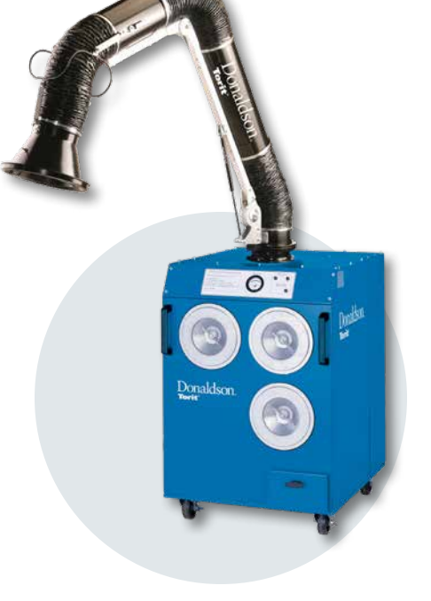
Easy-Trunk<sup>™</sup> Fume Collector