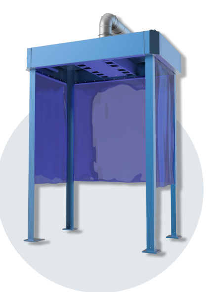
Torit<sup>®</sup> Fume Hood