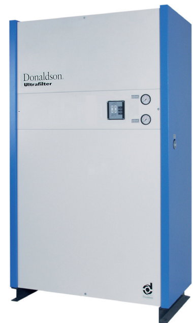
ALG 80 S - 375 S