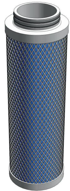
Depth Filter UltraPleat® FF