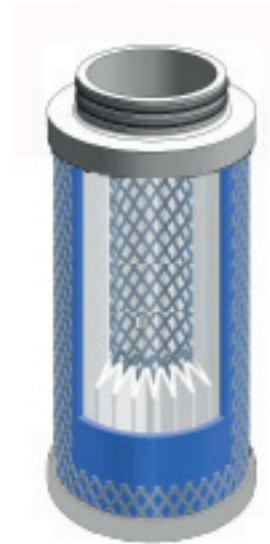
Cross section of the depth filter

By utilising various filtration mechanisms such as retention by direct impact, sieve effect and diffusion effect, liquid aerosols and solid particles down to the size of 0.01µm are being retained in the filter.