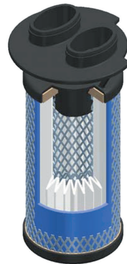
Cross section of the depth filter

By utilising various filtration mechanisms such as retention by direct impact, sieve effect and diffusion effect, liquid aerosols and solid particles down to the size of 0.01µm are being retained in the filter.