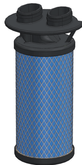
Depth Filter UltraPleat® M