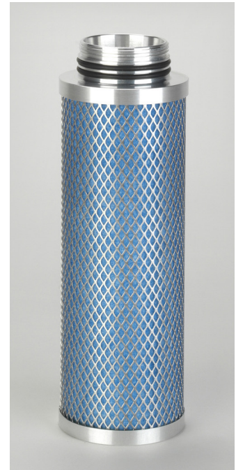
Depth filter CF