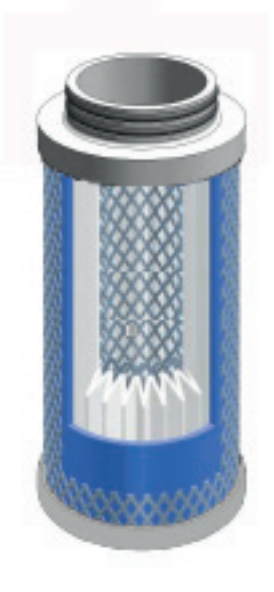
Cross section of the depth filter

Cross section of the depth filter with SEM micrograph of the filter media