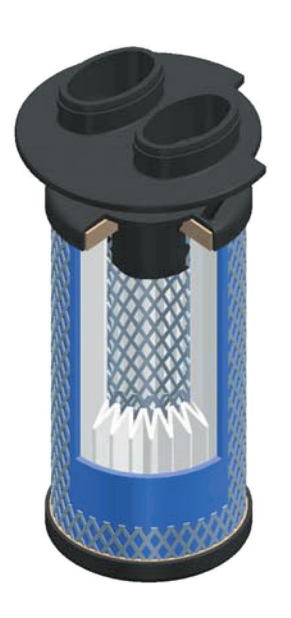
Cross section of the depth filter

The UltraPleat® S filter element is designed and developed for the following applications: