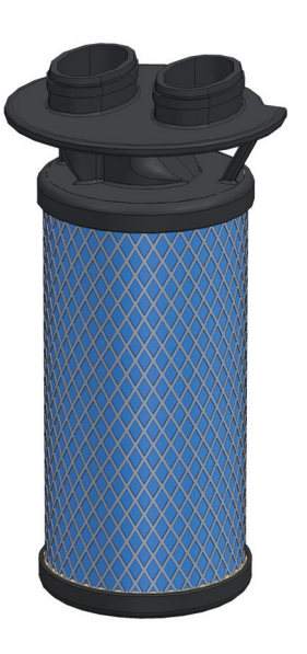
Depth Filter UltraPleat® S