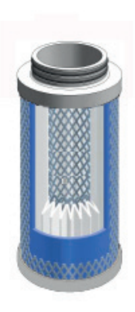
Cross section of the depth filter

The UltraPleat® SMF filter element is designed and developed for the following applications: