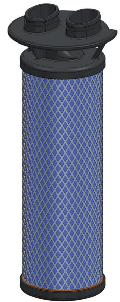
Depth filter V