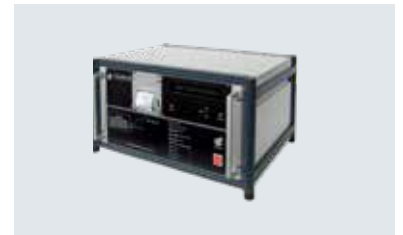
Filter Test Center (FTC)