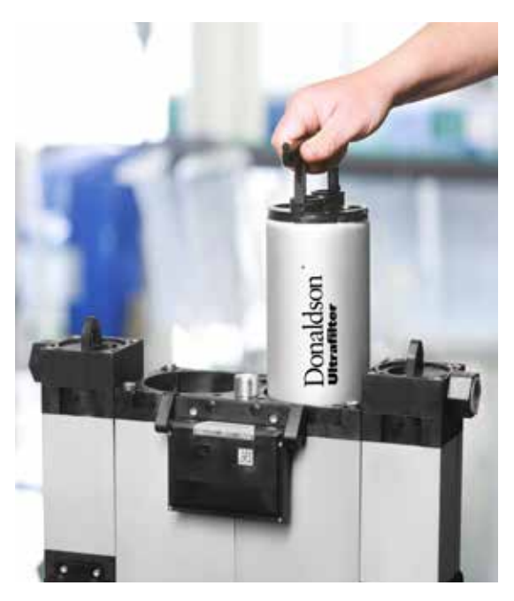
Clean and easy Exchange of the Cartridges