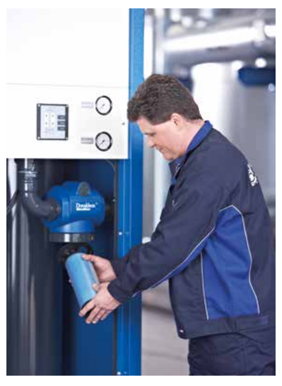
The Ultra-Filter Housing is easy to open in order to change the Filter Element

Donaldson provides services for all components of your compressed air system – the best selection of individual services or full service. Agreements comprising of different maintenance offerings tailored to fit your needs and requirements.