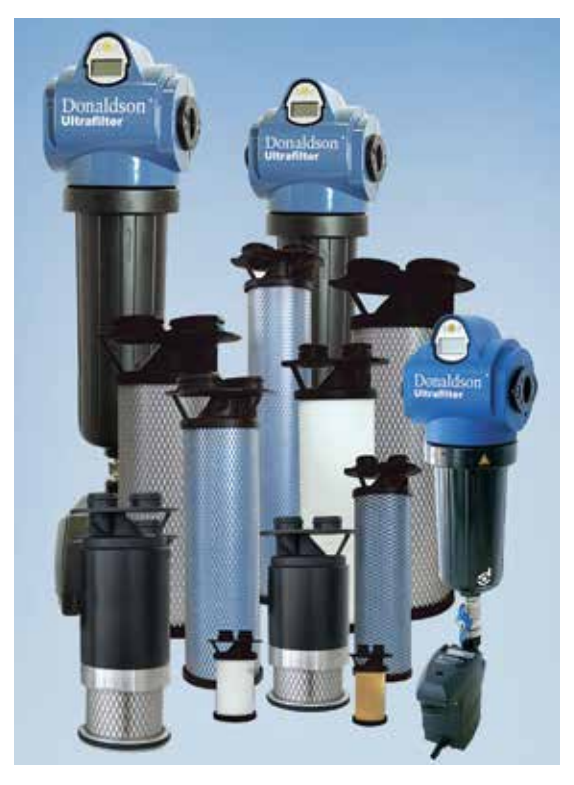
With the correct Selection of the Filtration Level and Flow Rate for individual Applications, the right Product is always available