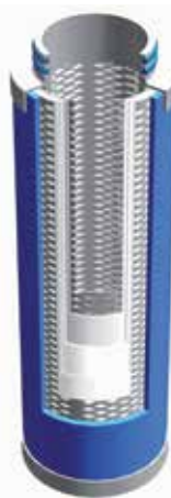
P-FF, P-MF, and P-SMF

By using various filtration mechanisms such as impaction, sieving, and diffusion, liquid aerosols and solid particles down to the size of 0.01 µm are being retained in the filter.