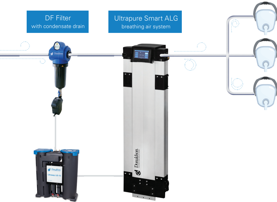
Ultrapure Smart ALG breathing air system