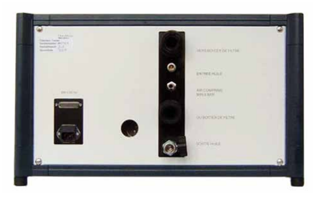
Filter Test Center (FTC)