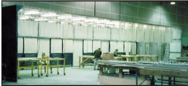
Environmental Control Booth

Donaldson's ECB works by creating a self-contained working environment complete with lighting, sound proofing and built-in dust collection. Workers inside the booth enjoy complete freedom of movement, cleaner air and excellent visibility. Using Ultra-Web filter media with our proprietary nanofiber technology, the powerful filtration capabilities of ECB prevents migration of dust to other parts of the plant, protecting workers outside the booth from the dust and noise generated inside the booth.