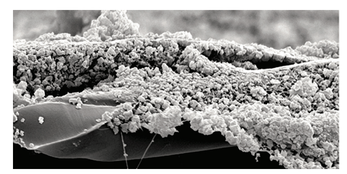
Surface-Loaded Ultra-Web Media (substrate still clean)