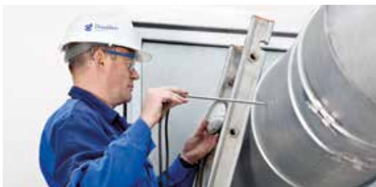
Air Flow Measurement

By means of a "Filter and Air Audit," you can analyze the performance and costs of your dust collectors – defining the air quality and identify possible saving potentials. A Donaldson service expert will perform air flow, pressure drop and emission measurements and report on the overall condition of the dust collector.