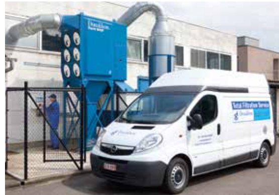
Total Filtration Service for Dust Collection

Thanks to Donaldson's broad service network, you receive quick and cost-effective competent services for all filtration applications from one source. Rely on our qualified service engineers to help you optimise your filtration systems. Please find our locations on www.DonaldsonToritDCE.com . We are at your service and in your neighbourhood!