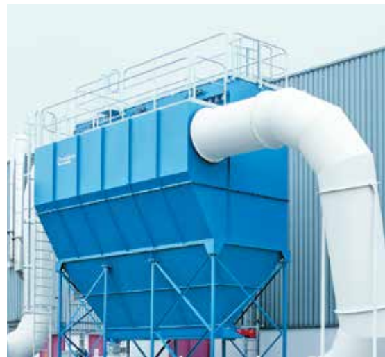
Tailor-made compact Modular Baghouse

To ensure the perfect match between on-site operating conditions and system settings, professional commissioning is a must. Only if on-site operating conditions and system settings are perfectly matched will your system deliver the best performance and reliability at the lowest operating cost.