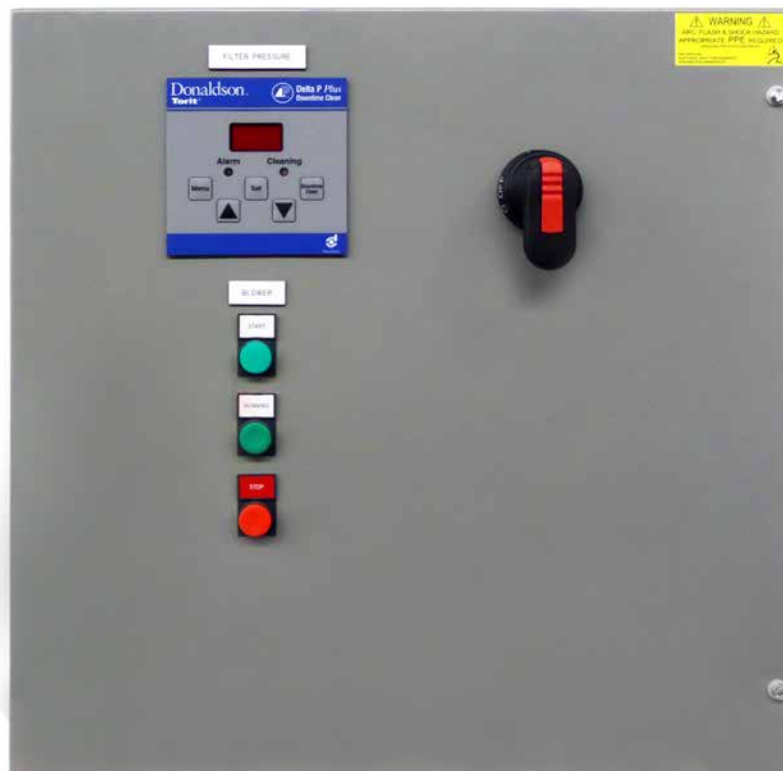
Electrical Control Panel (Delta P or Delta P Plus Control and Through-the-door disconnect)

Operates as a combination of a motor starter for blower motor on/off control, protection from short circuits and running overloads, and pulse cleaning control to maintain uniform filter pressure drop.