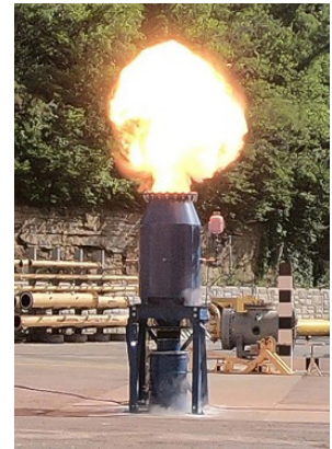
Full-scale testing of the Sealed Drum Kit.

Full-scale testing of the SDK showed it contains flames or sparks from the connection between a properly vented dust collector hopper and the attached drum. When applied in conjunction with effective dust collector explosion protection strategies, including explosion venting or suppression, the Donaldson Torit SDK may be an option for your combustible dust strategy. Consult appropriate standards and experts for further details and considerations.