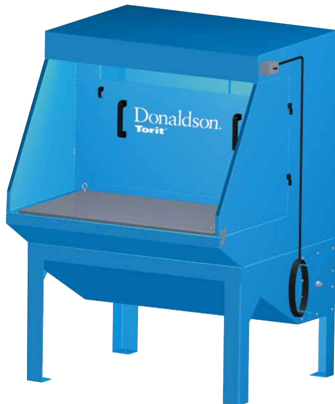
RWB - 2000

Designed for weld fume applications, the remote workstation integrates easily with other Donaldson® Torit® air filtration products.