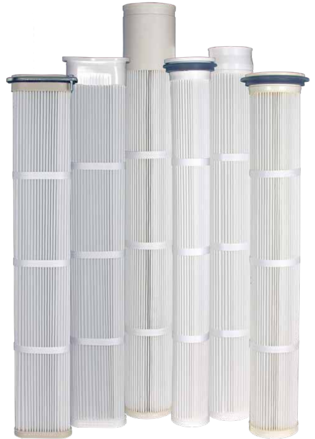
Ultra-Web SB Pleated Bag Filters

Available for all popular brands of baghouse collectors