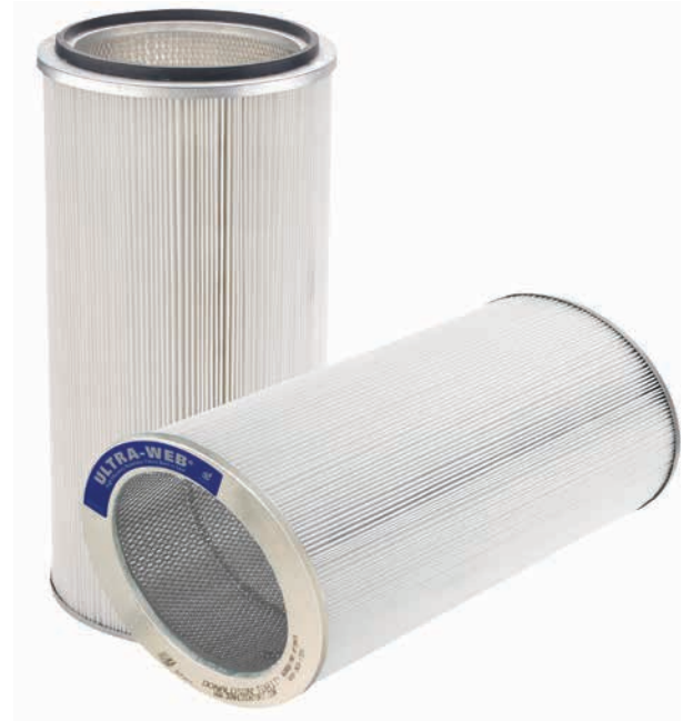
Ultra-Web SB Cartridge