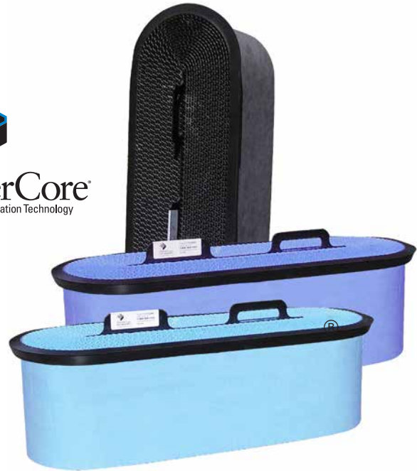
PowerCore® CP Filter Pack

PowerCore A Donaldson Filtration Technology