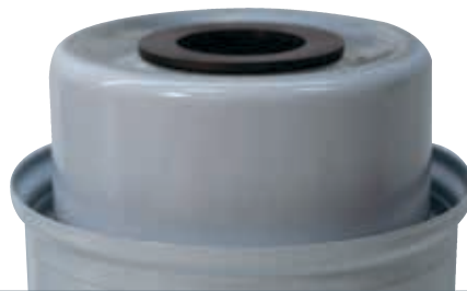
In with the New!

Keys have been removed for a universal fit