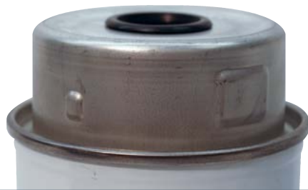
Out with the Old

Out with the old, in with the new. Donaldson filters for Stanadyne® Fuel Manager® FM100 fuel systems provide complete coverage with fewer part numbers. Buy one Donaldson replacement filter to fit multiple off-road applications. Our filters will accommodate your existing OEM drain valves, WIF sensors and bowls.