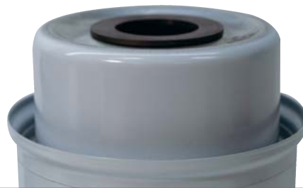
In with the New!

Keys have been removed for a universal fit