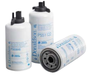
Cummins® engines Twist&Drain™ filters with integrated WIF sensors simplify the complicated task of removing water.

Cummins® is a registered trademark of Cummins Inc. Racor® is a registered trademark of Parker Hannifin Corporation.