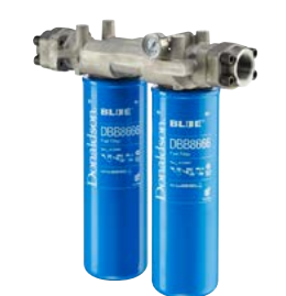
High Capacity Kit includes dual head, high efficiency diesel filters (2), pressure gauge and flange adaptors.