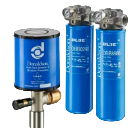
Clean & Dry Kit includes single head (2), high efficiency diesel filter, water absorbing filter, pressure gauge (2) and T.R.A.P™ breather.