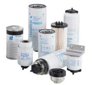
Fuel filters protect engine components and help extend equipment life.

Donaldson fuel filters help keep your engines and equipment running smoothly. They're a better way to filter fuel.