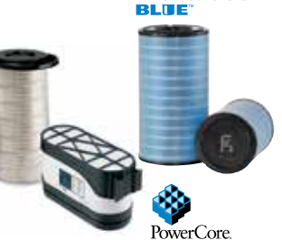
Replacement filters deliver better protection with Donaldson Blue® filters or PowerCore® filtration technology.