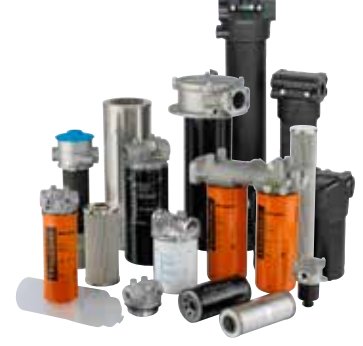
Low, medium and high pressure housings and filters, including Donaldson Duramax® to protect machinery and hydraulic components in hundreds of heavy-duty equipment applications.