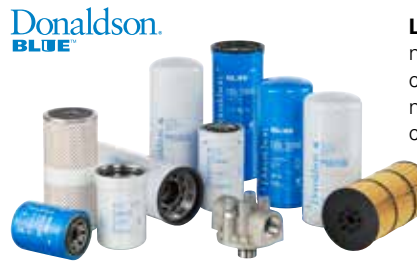
Lube filters capture metals, soot and contaminants to maintain higher cleanliness standards.

Donaldson lube filters keep oil clean by capturing contaminants that can cause engine damage.