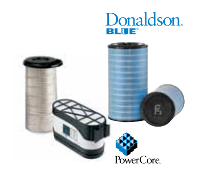
Replacement filters deliver better protection with Donaldson Blue® filters or PowerCore® filtration technology.