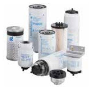
Fuel filters protect engine components and help extend equipment life.

Donaldson filters help prevent injector damage by delivering clean fuel to your engine. They're a better way to filter fuel.