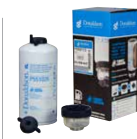
Fuel Filter Kits include Twist&Drain™ filters with standard valve, water collection bowl and alternative valve with WIF sensor or threaded port.

Cummins® is a registered trademark of Cummins Inc. Racor® is a registered trademark of Parker Hannifin Corporation